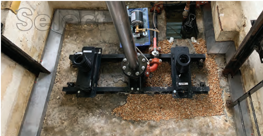
Our Perimeter Drain with Gutter System