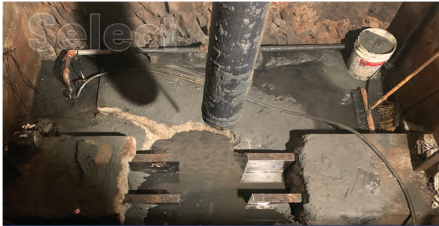
Removal of Old Hydraulic Jack