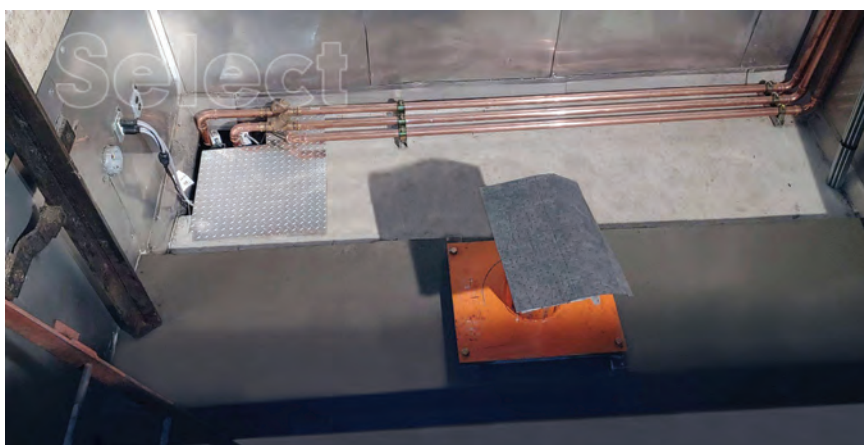
Fully Waterproofed Pit Ready for New Hydraulic Jack