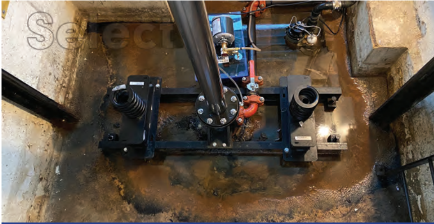
Leaking Around Casing