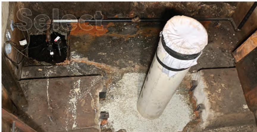
Installation of Waterproofing Materials