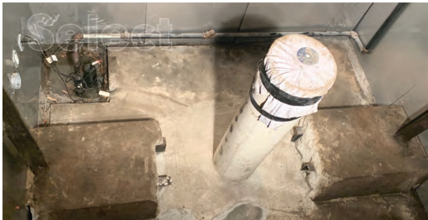
Sealing Process of New Casing